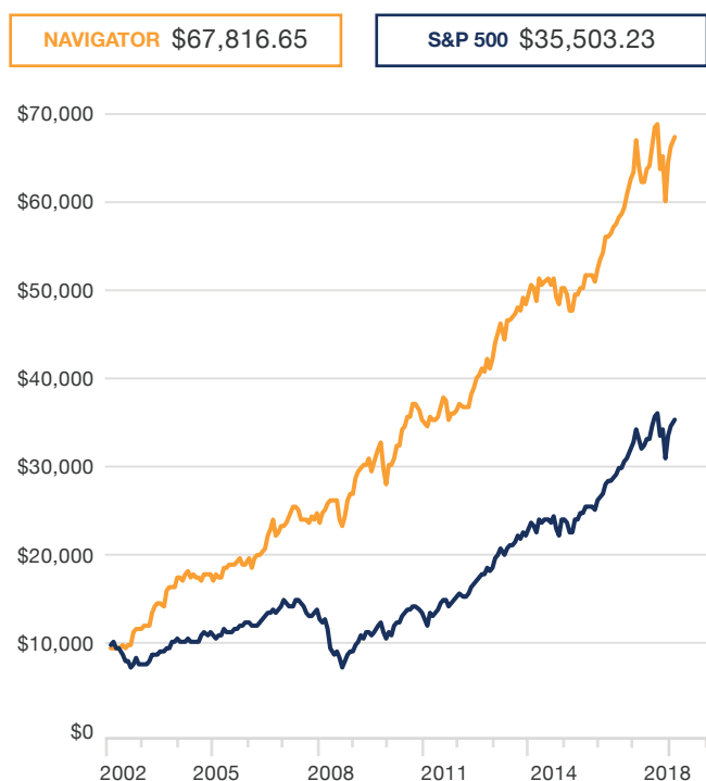
This chart illustrates the performance of a hypothetical $10,000 investment made in the Fund on 02/01/2002 following its inception. Assumes reinvestment of dividends and capital gains. This chart does not imply any future performance.